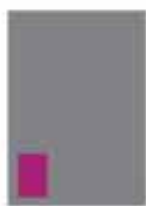
Sixteenth Page (portrait) 44mm x 66mm £105