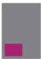
Eighth Page (landscape) 94mm x 66mm £190