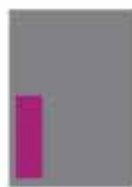
Eighth Page (portrait) 44mm x 138mm £190