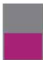
Half Page (landscape) 194mm x 138mm £600