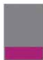
Quarter Page (landscape) 194mm x 66mm £335