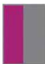
Half Page (portrait) 94mm x 282mm £600