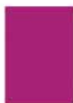
Full Page 210mm x 297mm (plus 5mm bleed) £1200